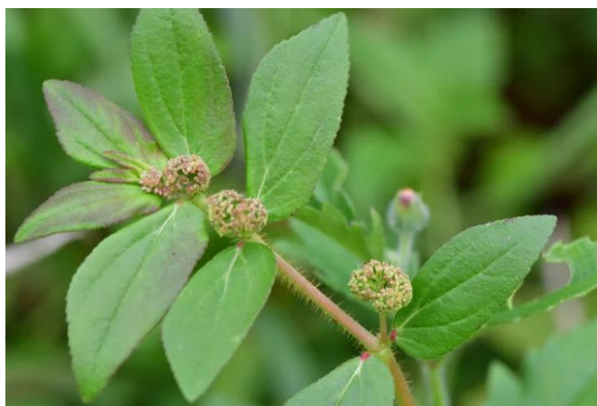
Figure.1; Euphorbia hirta plant